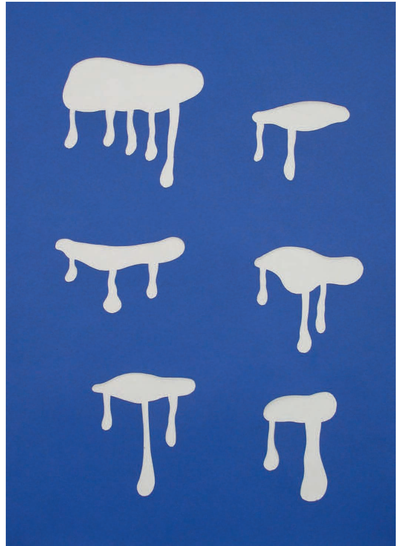
Untitled, 2011, cut and painted paper, 24.8" x 17.3"