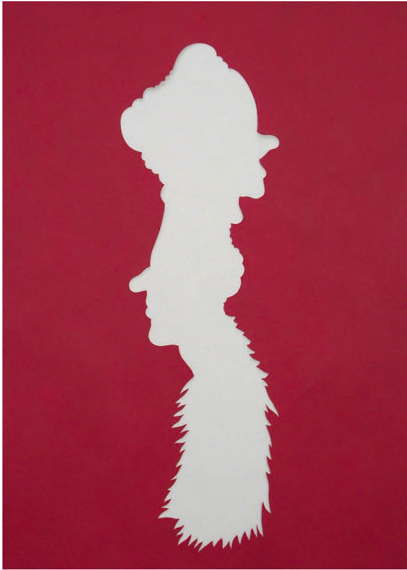
Untitled, 2011, cut and painted paper, 24.8" x 17.3"