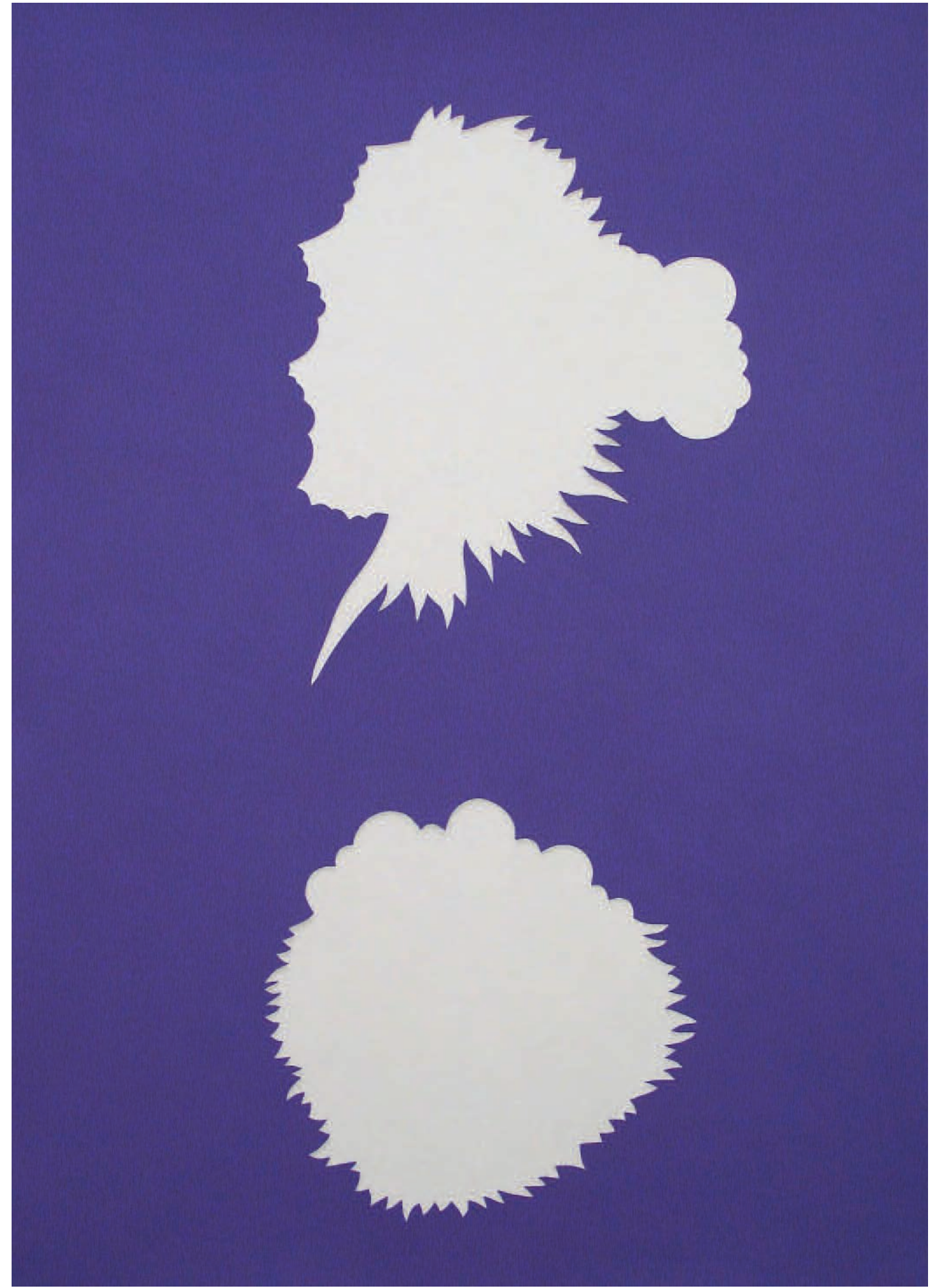
Untitled, 2011, cut and painted paper, 24.8" x 17.3"