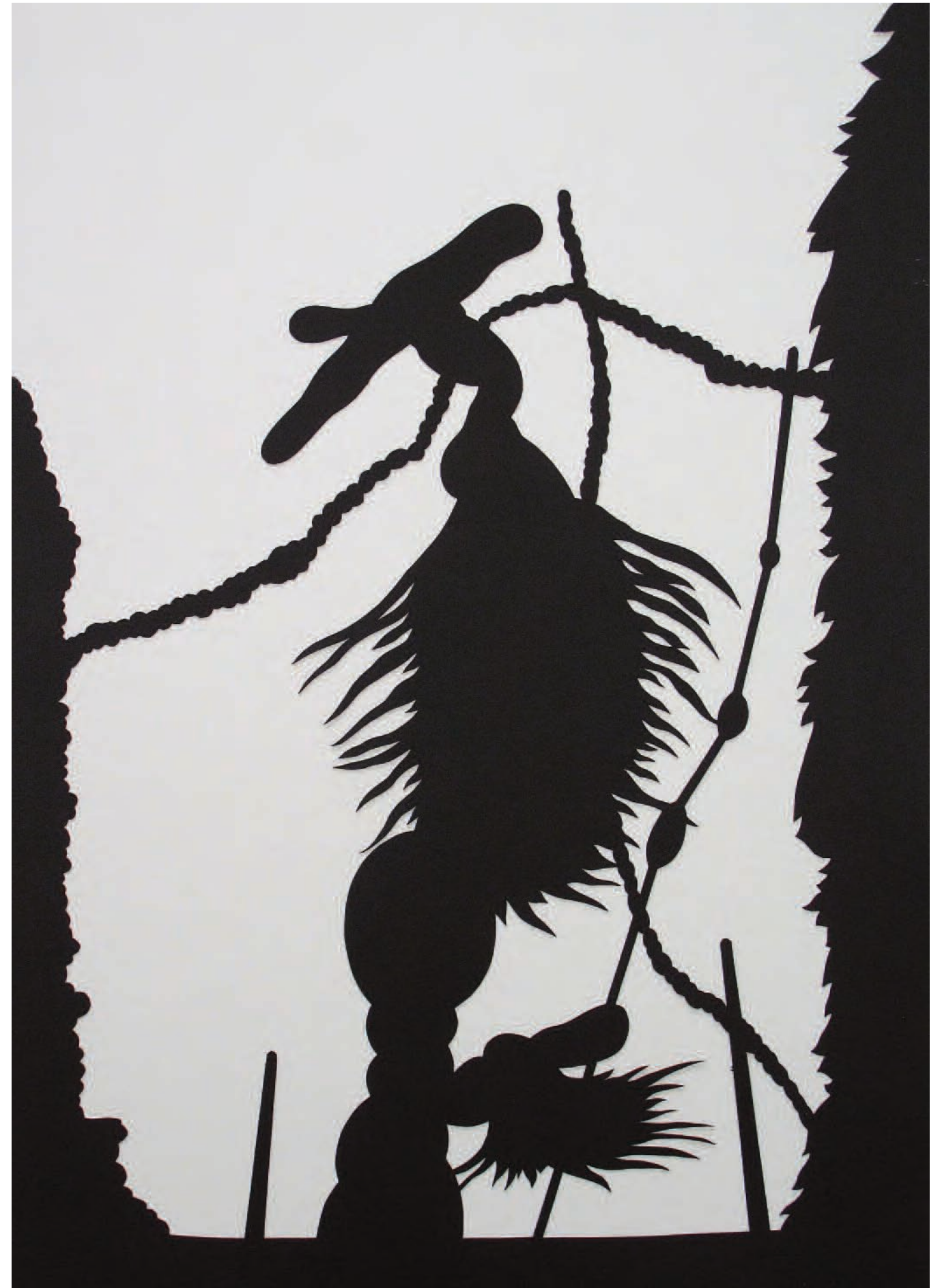
Untitled, 2011, cut and painted paper, 24.8" x 17.3"