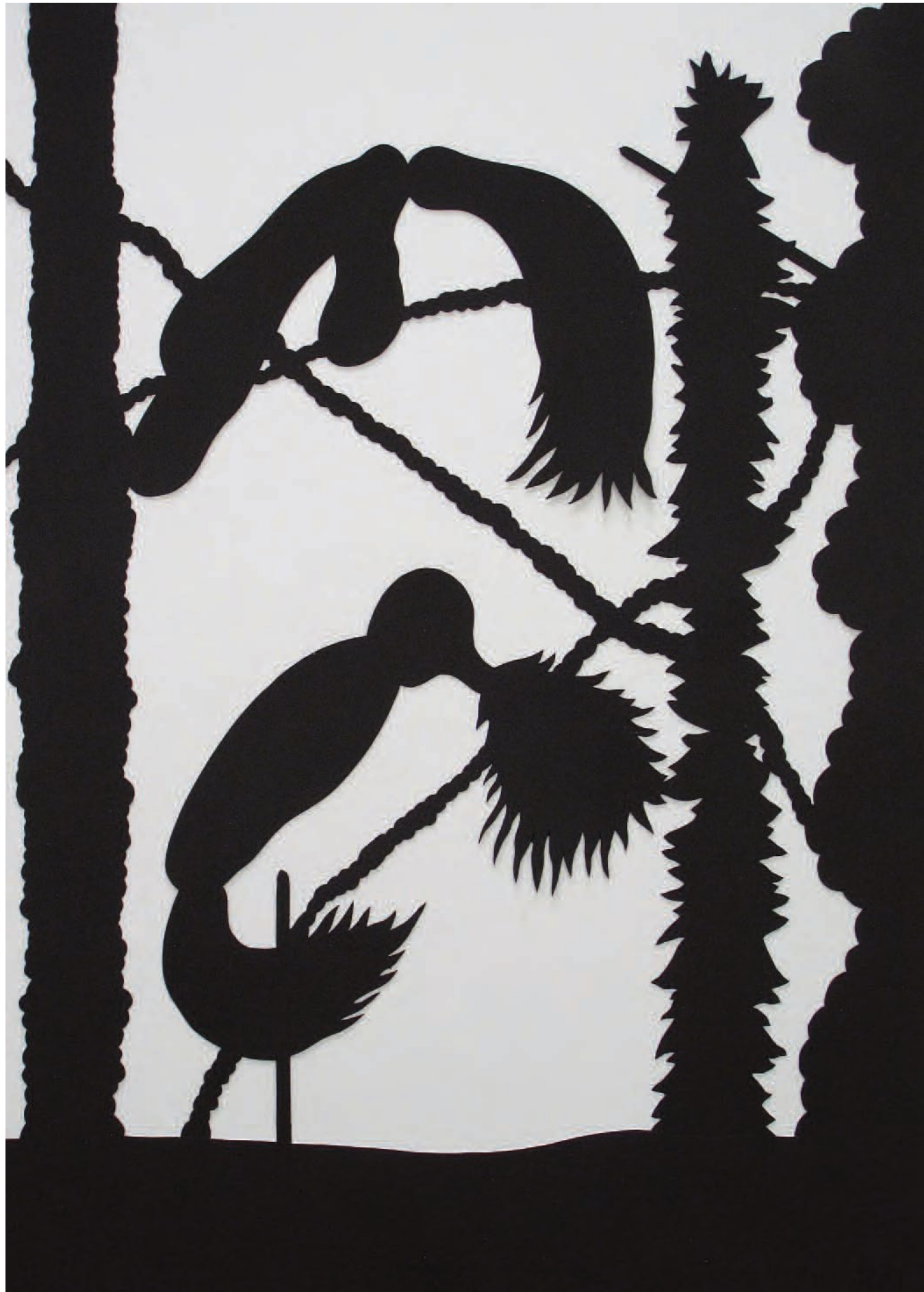
Untitled, 2011, cut and painted paper, 24.8" x 17.3"