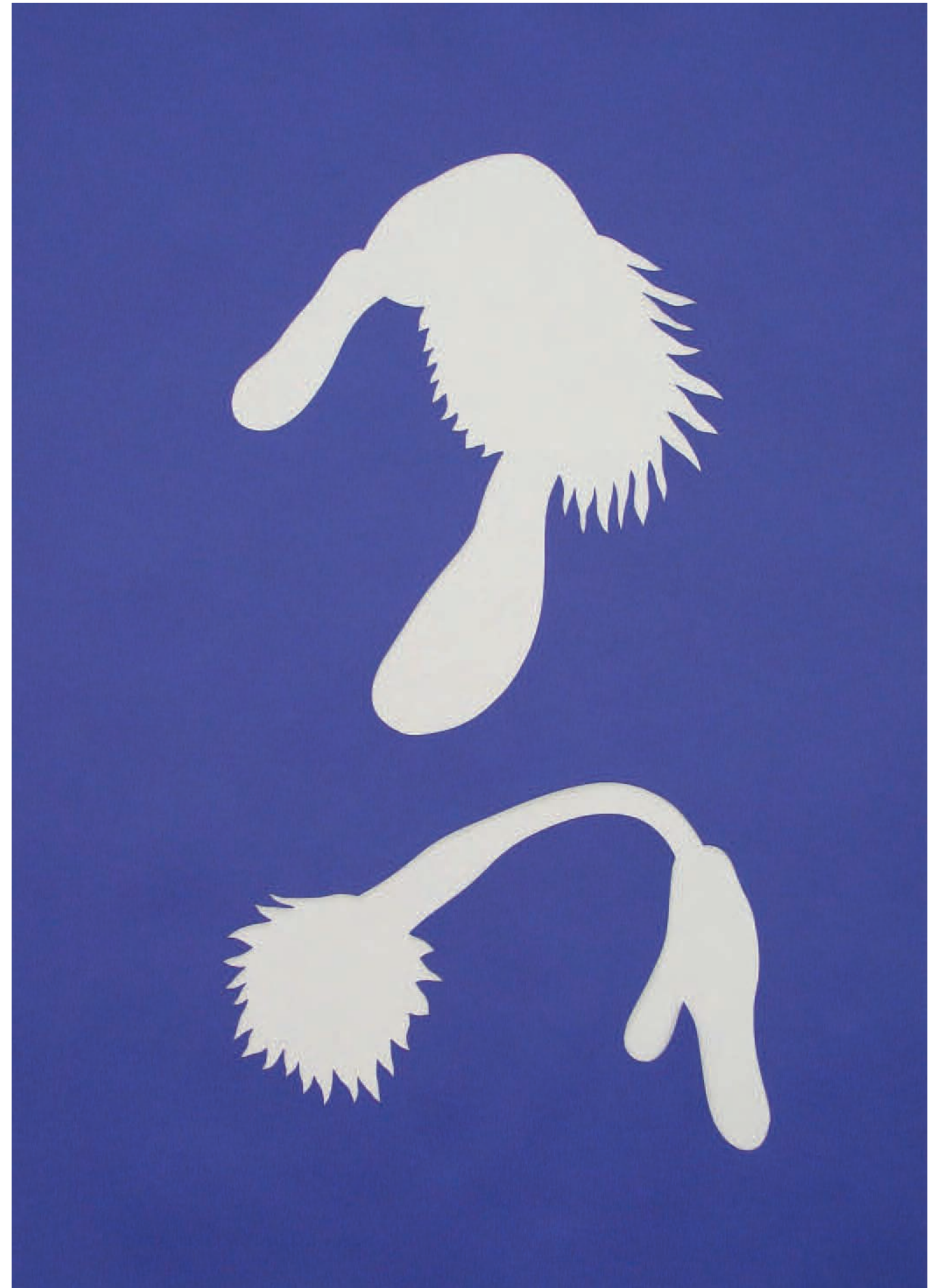
Untitled, 2011, cut and painted paper, 24.8" x 17.3"