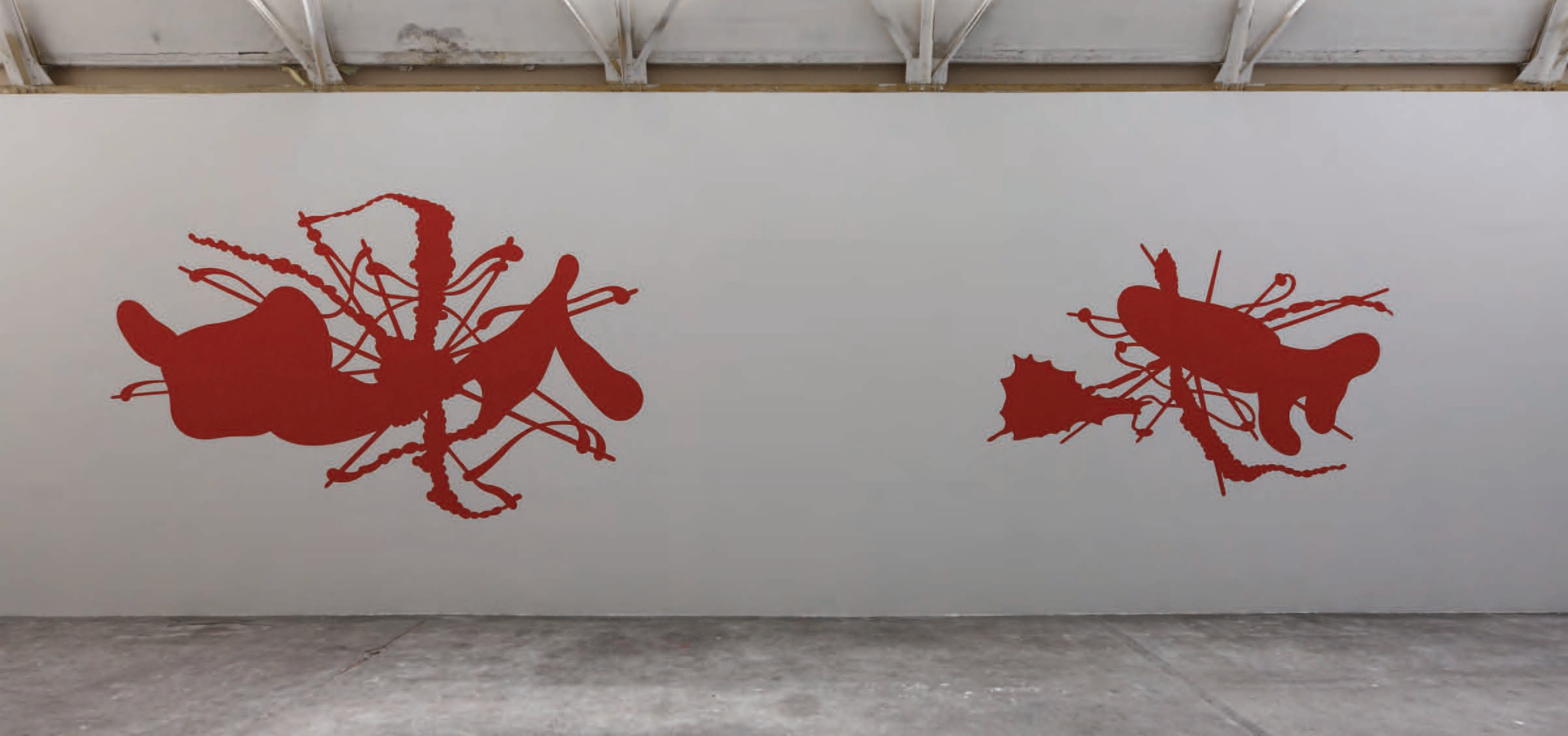
Untitled , 2011, cut and painted paper, 24.8" x 17.3"